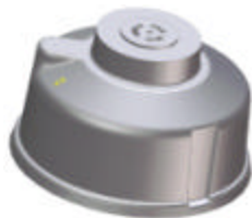
Twistlock Photocontroller socket mounted version